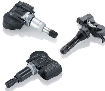
Tire pressure monitoring systems (TPMS)