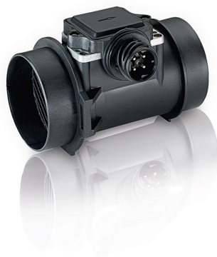
Sensors for engine management