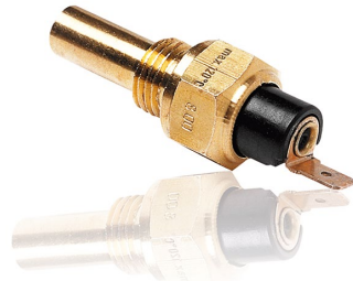
Sensors for instrumentation