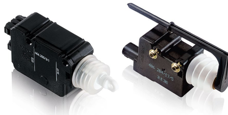
Actuators for central locking