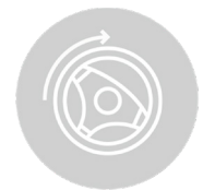
Steering angle sensor